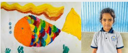
Grade 1 - Manuldi Disenya