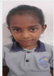
Grade 3 – Isali Lohansa

My pet is a dog It is Roba It is a beautiful dog It is black and brown in color It can run fast and it likes to play with me It can bark It protects our house. It is my best friend. It waves its tail when sees me. It likes to eat meat and I love my pet.